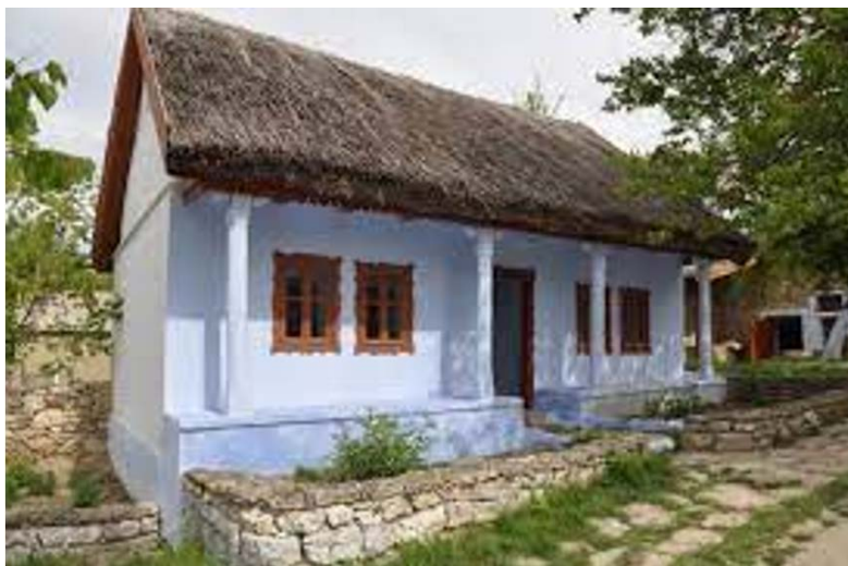
Figure 1. House-museum in Butuceni village, Orheiul Vechi, Republic of Moldova.

The technology of blocks or so called clay "adobes" used in the construction of houses offers an effective solution in saving energy, reducing waste, reducing environmental impact and designing a healthy eco system. (Fig. 1).