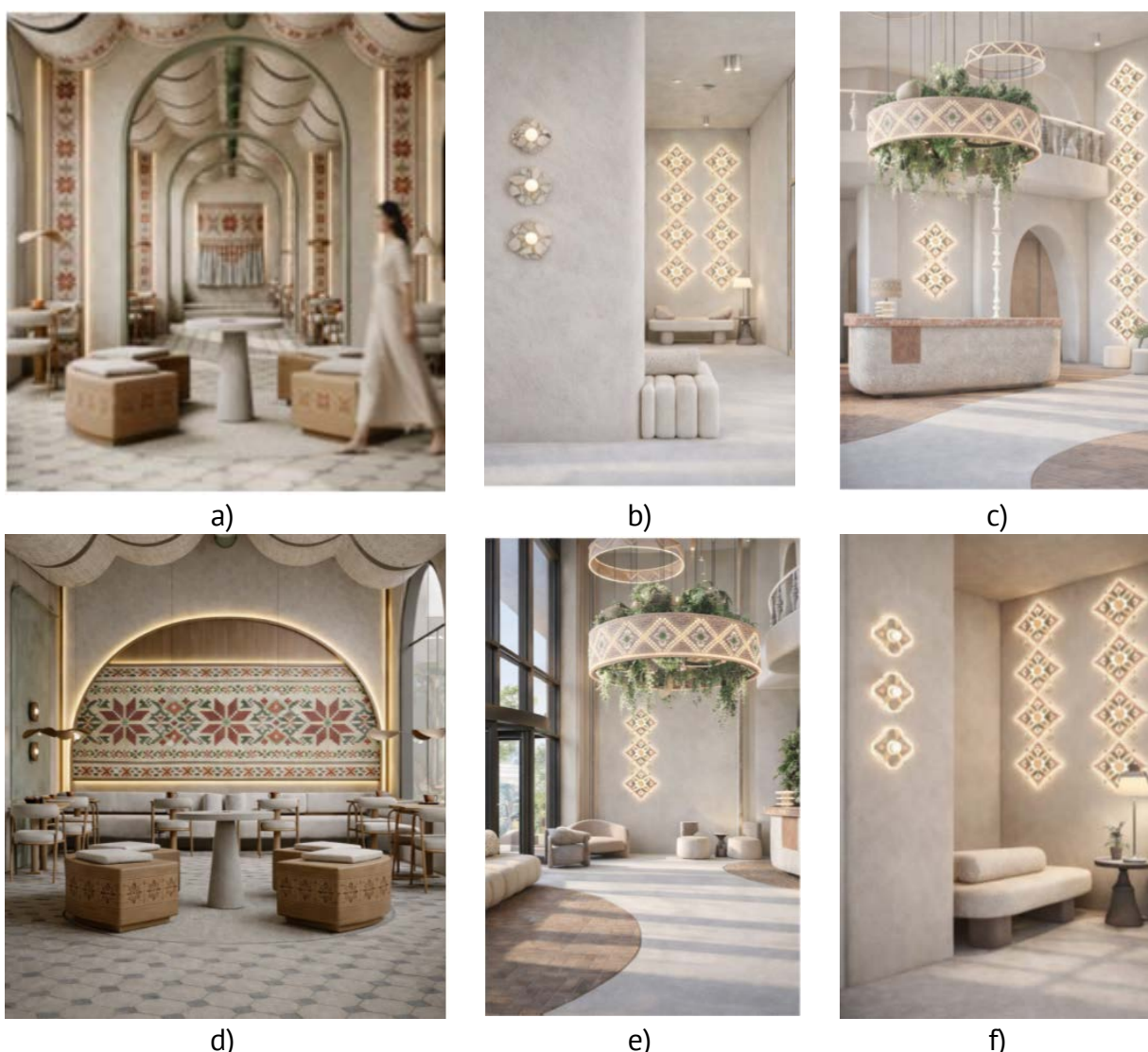
Figure 2. Concept projects of interiors in traditional style with the implementation of ecological materials (a,b,c,d,e,f).

The use of clay in construction is not an invention of a single people, but a practice of several countries and regions. For example, in France, the technique of compacted clay, called "terre pisé", has been widely used since the 15th century; in Germany, old houses made of compacted clay are known, dating back to 1795; and in Western Europe, the advantages of clay for creating comfortable living conditions have been appreciated [20, 18]. Thus, several researchers have argued that houses that have clay as the main building material have a characteristic or particular exterior appearance, with a freedom of plastic modeling [15, 23]. Signaling some parallels with other cities from the 17th century, found in some documentary sources about the city of Chisinau, regarding the material from which the houses were built, wood was the basic material, then gluing the walls was present in the construction techniques, the poorest houses were covered with straw, the best material was reed, used for the roofs of the houses, shingles were a more precious and expensive material [25]. (Fig. 2 a,b,c,d,e,f).