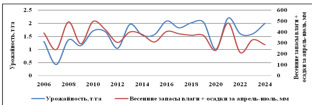
Figure 4. Correlation between the sum of spring moisture reserves and precipitation for the months of April-July with crop yield (Pearson coefficient r = 0.505 )

Thus, the conducted analysis of the correlation between the sunflower yield and natural moisture reserves allows us to state that the meteorological conditions of our region limit the productivity of sunflower at a level of 2.0-2.2 t/ha, and that the only condition for increasing it is irrigation.