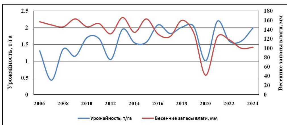
Figure 2. Correlation between spring productive moisture reserves and sunflower yield (Pearson coefficient r = 0.145 )

Rising air temperatures contribute to increased physical evaporation from the soil surface and plant transpiration, so in these conditions, the question of whether natural moisture supply allows sunflower to reveal its potential is of particular interest. From 2006 to 2018, spring reserves of productive moisture were within 130–166 mm, then sharp declines began, reaching a minimum (42 mm) in 2020 (Fig. 2). Agricultural producers believe that crop yields in most cases depend on spring reserves of productive moisture in the soil, but this was not confirmed in our studies (Fig. 2). Most likely, natural reserves of moisture supply in the soil have a greater impact on the effectiveness of fertilizer application in the early stages, thereby providing a good start for plant development.