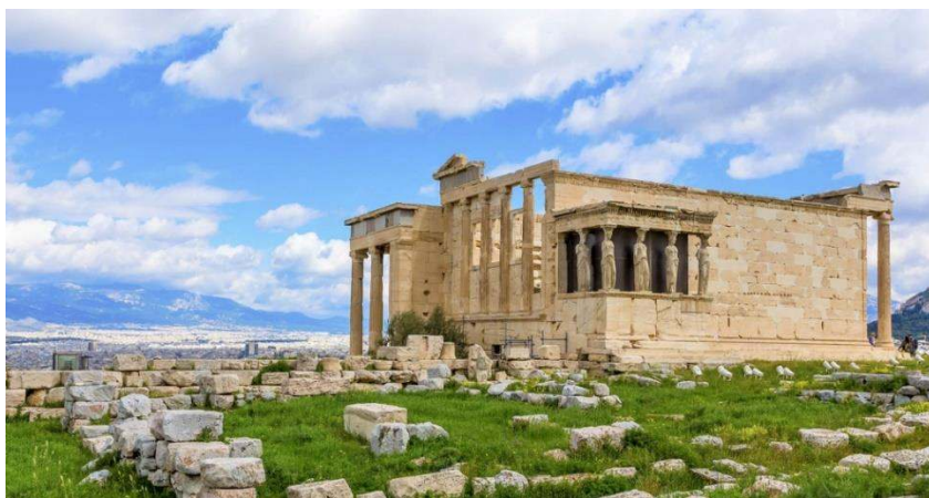
Figure 2. The Erechtheion Temple on the Acropolis of Athens

Asymmetry in the composition can achieve completely opposite results, if their visual center is shifted to one of the flanks, they will look more dynamically and moveably, while the center in the middle will give the structure a static and heavy look.