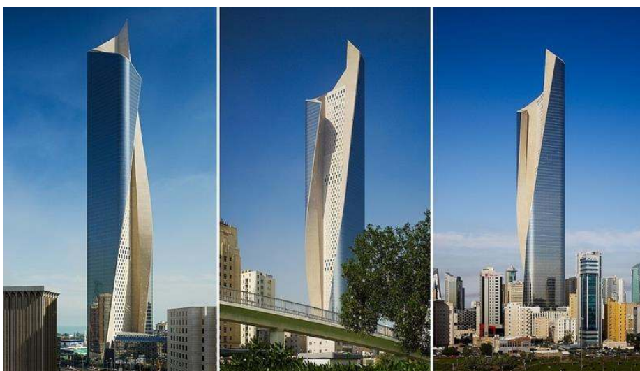
Figure 3. Al-Hamra in Kuwait - one of the most asymmetric skyscrapers in the world

Orientation, dynamism of composition is an important means of manifesting life processes. The axis is the main direction of movement, it is thanks to it that we can strive in the attracting direction.