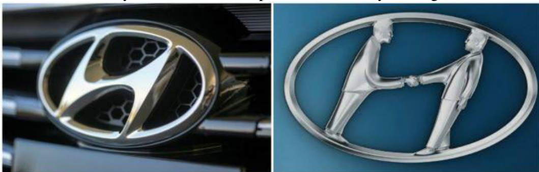
Figure 2. Hyundai logo

Hyundai - The letter H tilts to the right, indicating a forward movement into the future, yet there's more depth to it: The logo (Fig. 2) broadly corresponds to two figures engaging in a handshake [4]. This gesture acknowledges Hyundai's dedication to customer service and collaboration. Additionally, it embodies a salesperson successfully striking a deal with a customer.