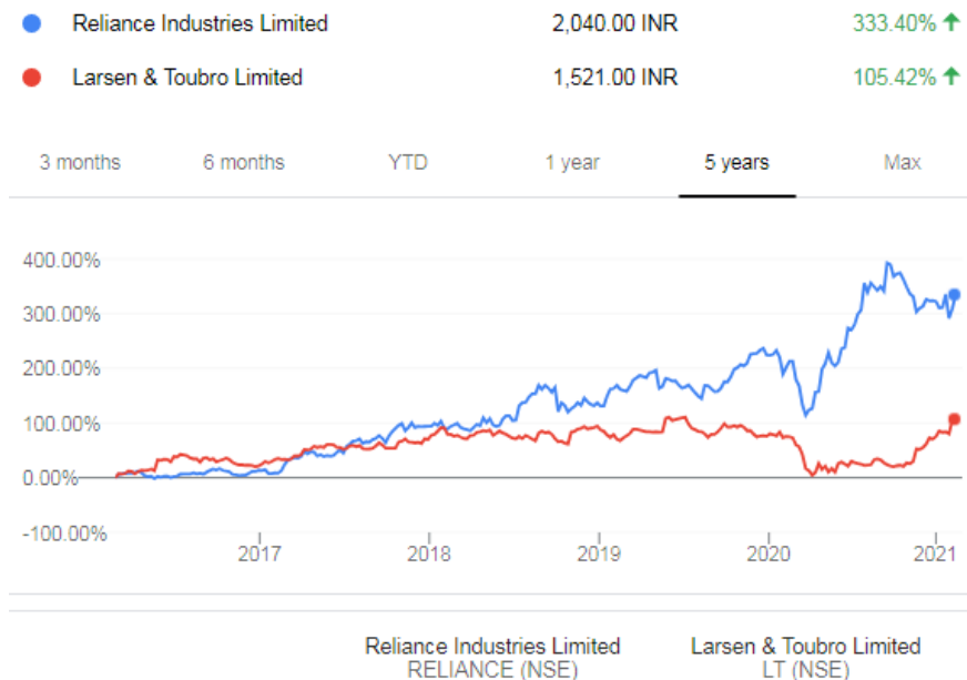
Figure 5. Easy comparison of two shares.

Comparing between two stocks can be easily predicted. For an example considering two shares comparison of reliance and Larsen, which is shown in figure 5.