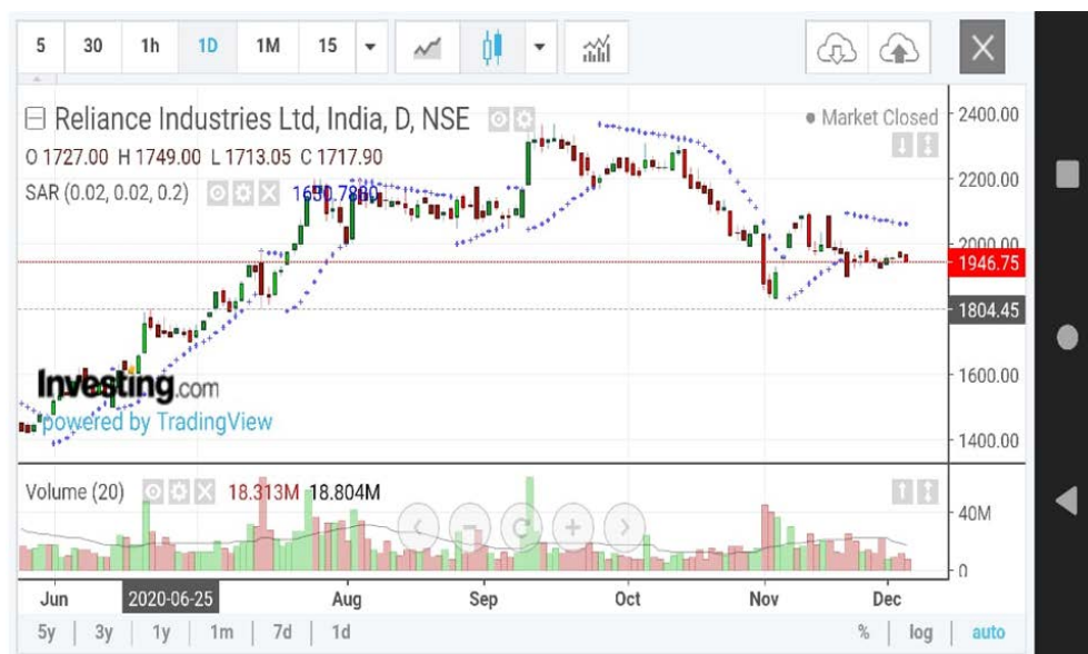
Figure 3. Parabolic Sar.

Different type moving average can be calculate by using tool, figure 2 shows for moving average strategies and figure 3 represents parabolic sar. Parabolic sar signals when close crossing buy or close crossing below sell.