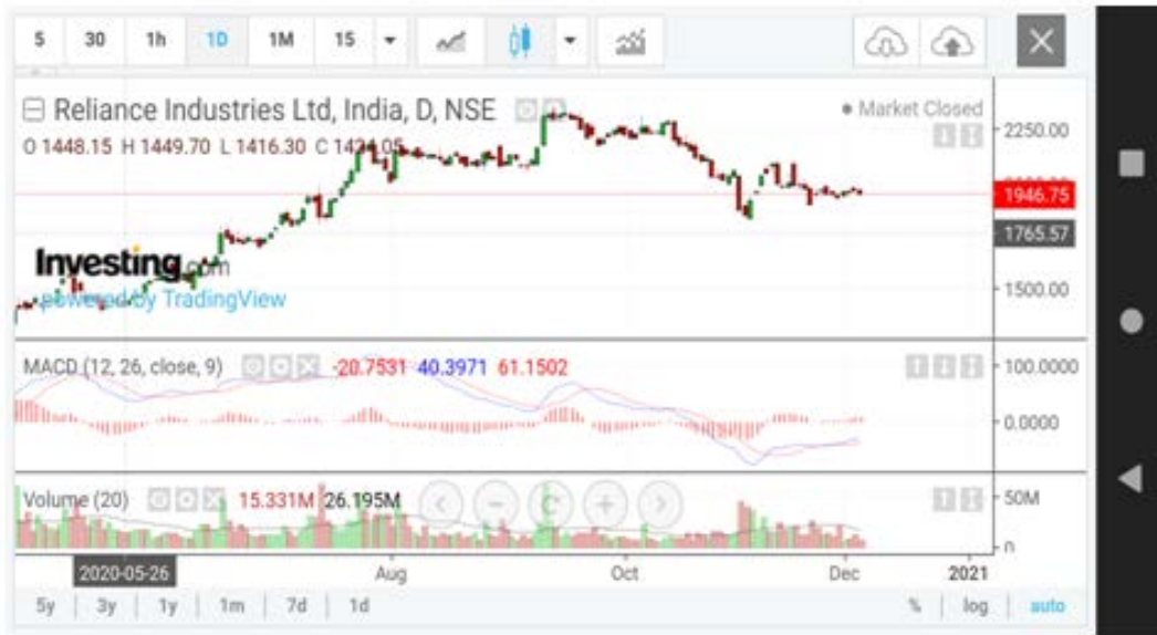
Figure 4. Moving average convergence divergence.

Profitable trading set up can be made by MACD (Moving average convergence divergence). All the figures 2, 3 and 4 represents the reliance industries ltd India NSE, so all type of analysis can be performed within few seconds through the analysis tool.