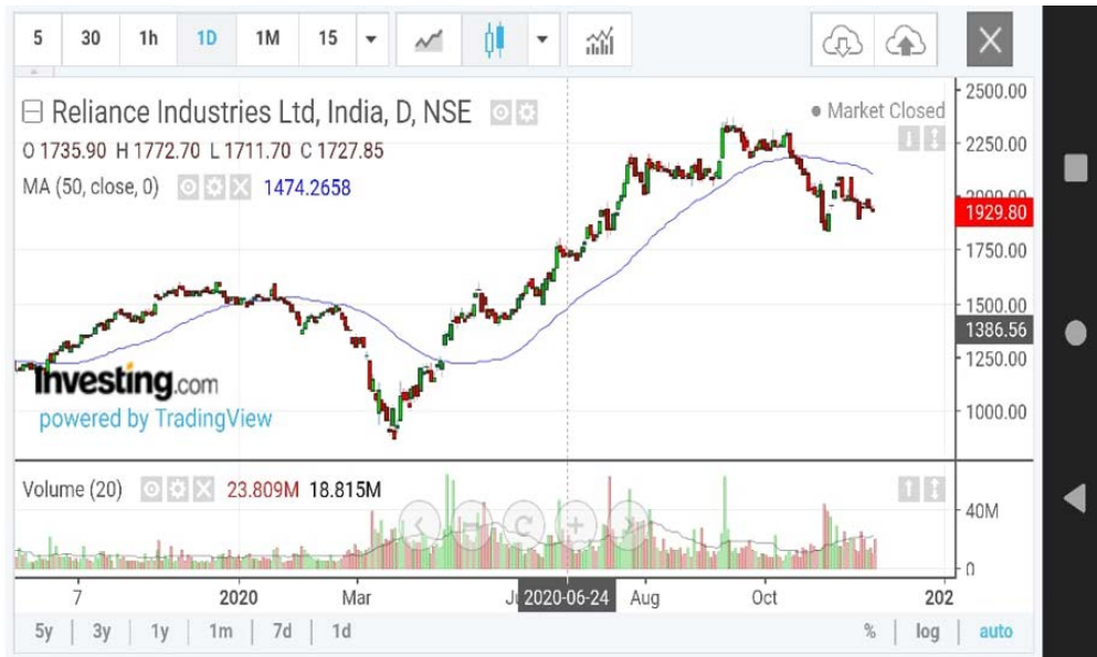
Figure 2. Moving average.

In financial for portfolio management AI techniques can help and improve the performance. Now a day's the ability of AI make it as essential for trading. AI helps in model validation, back testing, trading, portfolio composition also helps to finding the fraud detection in financial services.