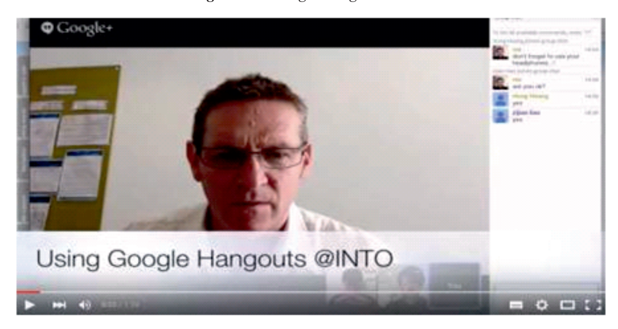
Figure 4: A Google Hangout session

Creating efficient and useable asynchronous and synchronous pedagogies, has required much planning and research, particularly important when attempting to support learners whose first language is not English. Initial feedback from the research cohort included some pertinent examples, which helped in the construction of the framework and fundamental in scaffolding a robust design framework for the University of Gloucestershire's hybrid module design. Figure 5 offers formal evidence extracted from the Universities ACE (Annual Course Evaluation) survey conducted with the whole year cohort of students who studied BM4115 The Global Business Environment hybrid module.