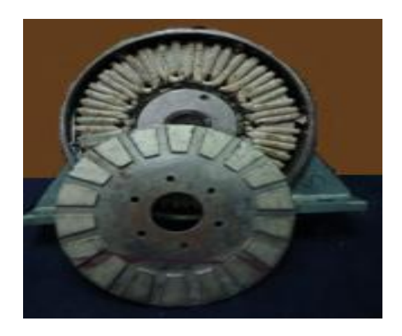
Fig.4.Axial synchronous generator with hybrid winding and smooth air gap

In synchronous generators as known, shocks of the drive torque or load variation can cause electrical oscillations of the generator rotor or turn out the generator of synchronism. These problems are described and solved rigorously for synchronous machines with electromagnetic excitation [3, 4, 5].