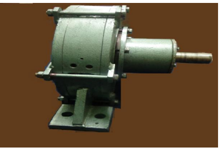
Fig.1 Axial synchronous generator with PM

In figure 1 is shown the synchronous axial generator with permanents magnets.