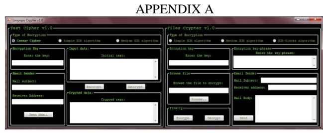
BitProtect Crypto-Service. GUI

files. This application is cross-platform, because it was written in C# language and it works on Microsoft Operating Systems and Linux Distributions, with Project Mono installed.