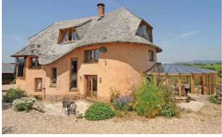
Fig. 1. New clay houses constructed cob building spetialist Kevin McCabea 1 mile from Ottery St Mary town centre unique design of houses built of clay, based on the concepts of organic architecture.