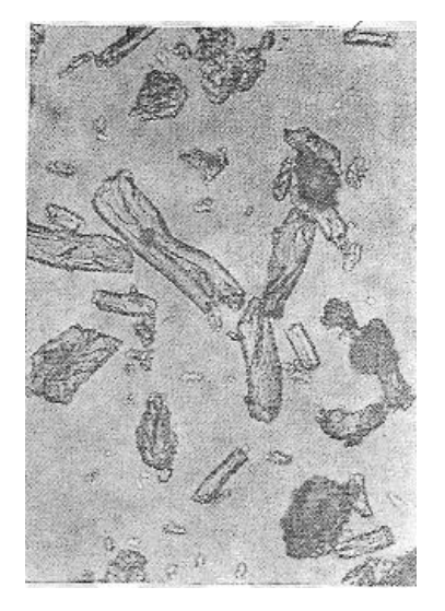
b) chemical process