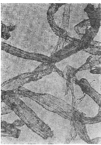
Figure 2. Microscope picture of microcrystalline pulps:

being made of aggregates with high orientation, bound by steady intermolecular bonds (figure 2).