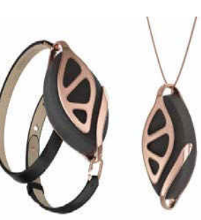
Figure 4. Leaf Urban, Bellabeat [13].

NFC Jewelry represents a type of smart jewelry that is part of the next generation of NFC wearable devices, focusing on quality design and advanced features. Each piece of jewelry, whether pendants, earrings, or rings, is equipped with an invisible NFC chip integrated into the sleek design, resembling classic jewelry. These pieces can interact with digital devices and exchange instructions and information, being compatible with both Android mobile phones and Apple iPhones. A notable example of interactive jewelry with NFC technology is the Momento collection from Galatea, which is patented and combines art with modern technology, allowing users to store personal memories in the form of voice messages, images, and texts Figure 6. To function, Momento jewelry requires a device with NFC support, such as an Android or iPhone. The creator of the "Smart Jewelry" line, the Momento collection, Davin Chi, describes this jewelry as "a digital locket for the 21<sup>st</sup> century," emphasizing its relevance in the contemporary context.