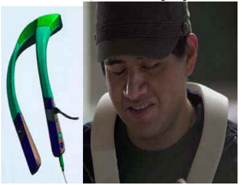
Figure 8. Toyota's guide collar for the blind and visually impaired [19].