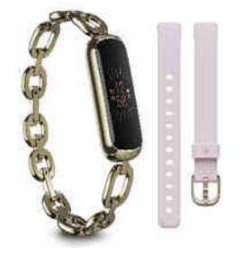
Figure 3. Fitbit Luxe Special Edition (Peony/Soft Gold)-JB Hi-Fi [12].