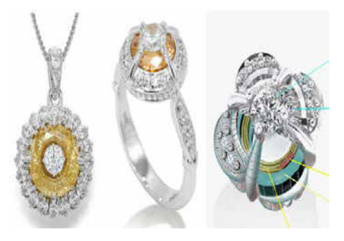
Figure 6. The Momento Collection, Smart Jewelry, Galatea [17].