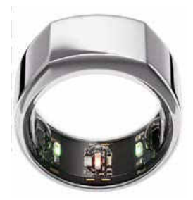
Figure 2. "Oura" Ring 4 [11].

Although smart jewelry offers extensive functionalities and opportunities for customization, challenges related to design, durability, and costs must be addressed to ensure their acceptance and success in the market.