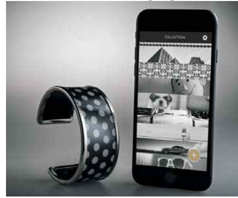
Figure 7. Bracelet Tago Arc [18].