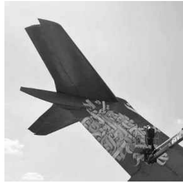
Calligraphic elements in decoration of a guitar and a airplane [22]