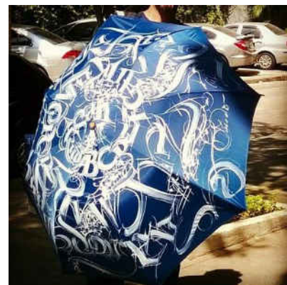
Calligraphic elements in technical products: umbrella [22]