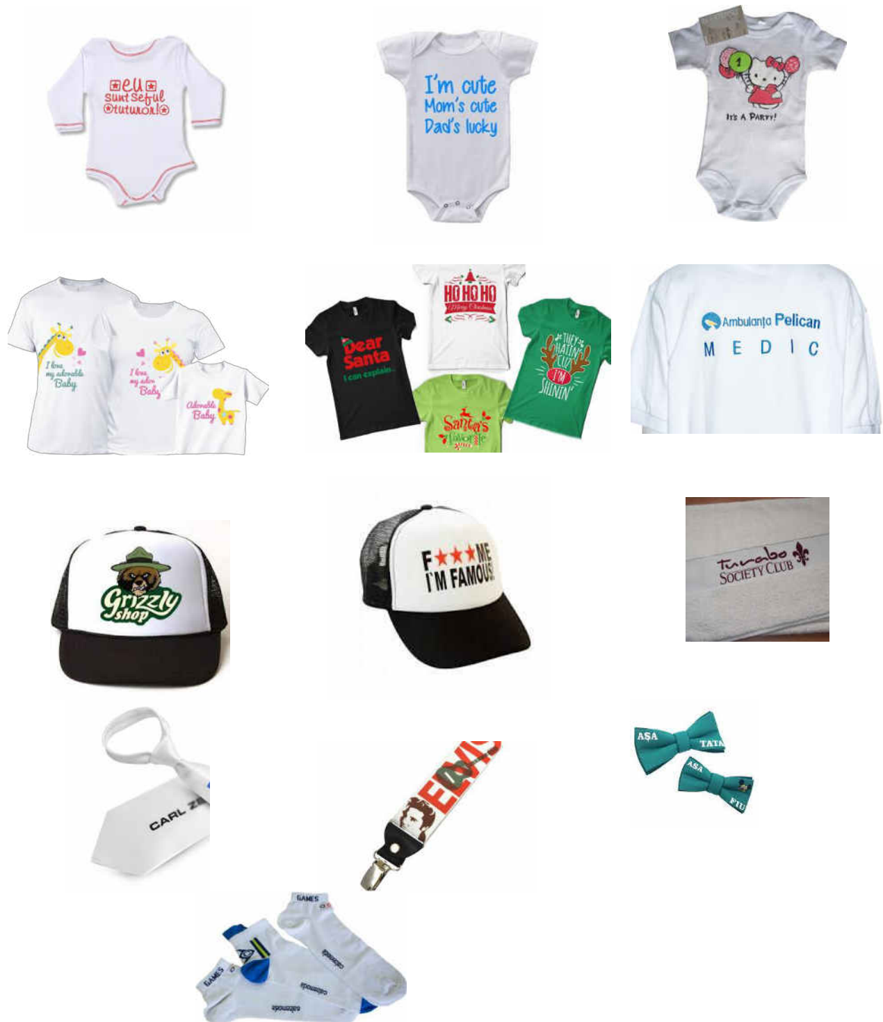
Figure 2: Clothing products decorated with calligraphic elements [2-3, 5-20]

The analysis of the possibilities of reproducing 2D or 3D calligraphic elements are made from thread, wool or ink with different properties.