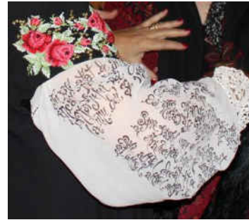
Calligraphic elements in clothing products [1, 21]