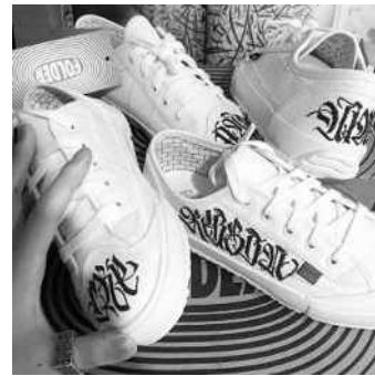
Footwear products decorated with calligraphic elements [22]