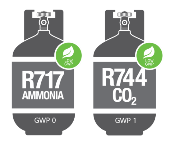
Figure 3. Low GWP refrigerants

Using low GWP refrigerants, we could minimize the risk of deteriorating the ozone layer from refrigerant leaks.