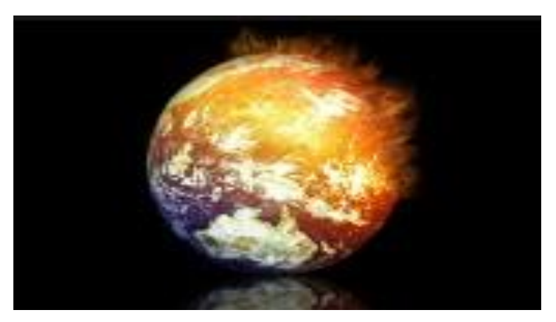
Figure 1. Climate changes [9,10]

Significant contribution to the objective of the Paris Agreement to limit the increase in global average temperature to a maximum of 2°C.