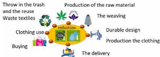
Fig. 1. The life cycle of clothing in the principle of "zero waste"

The circular economy strategy, reducing the use/reuse of polyester or non-degradable materials, followed by fashion entrepreneurs who propose the life cycle of clothing described by the route of the consumer's wardrobe that would bring zero waste imposes the stages: production of raw material, weaving, durable design, production the clothing, delivery, buying, wearing, reusing (fig.1).