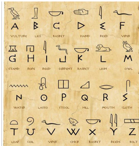
Figure 2. Hieroglyphic alphabet

Ancient cultures such as the Egyptians, Greeks, and Romans used symbols, typography, and imagery to communicate information, promote their beliefs, and commemorate important events [2]. The invention of writing systems, such as hieroglyphics (Fig. 2) and the Phoenician alphabet, marked significant milestones in the history of graphic design, allowing for improvement of the visual system.