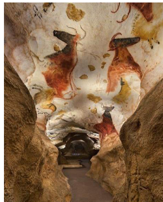
Figure 1. Lascaux Caves, France

The roots of graphic design can be traced back to prehistoric times when early humans used symbols and images to communicate ideas and convey messages [1]. Cave paintings found in various parts of the world, such as the Lascaux caves in France (Fig. 1) , provide some of the earliest examples of visual communication. These primitive forms of graphic design served practical purposes, such as recording hunting scenes or depicting religious rituals.