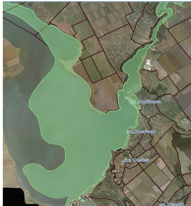
Figure 3 The territory of the reservoir belonging to the Republic of Moldova

potential project that could benefit is the exploitation of the surface of the reservoir by installing solar energy systems.