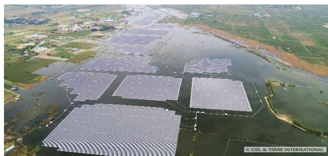
Fig. 4 The 70 MW project

[4] One of the oldest entries on the list, construction of the CECEP floating solar farm began in 2017. The 70 MW project finally became operational when it was connected to the grid in March 2019. This floating solar farm is owned by China Energy Conservation and Environmental Protection Group (CECEP) and installed using Hydrelia technology by French floating solar specialist Ciel & Terre, who also oversaw the design, delivery, and installation. The project covers more than 60 hectares and includes 194,731 solar panels.