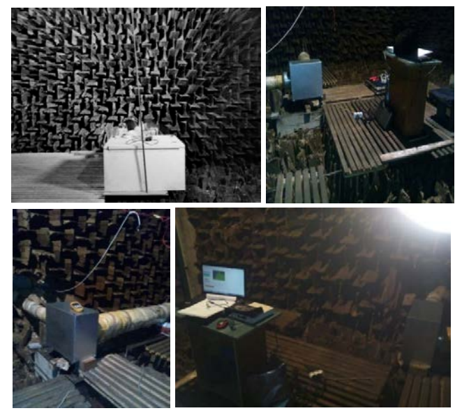
Figure 1. Anechoic chamber.

equipment. The Vibration Laboratory of the Faculty of Mechanics in lasi uses the camera for the vibroacoustic diagnosis of bearings, gearboxes, some car components, ventilation systems, noise attenuators, calibration of acoustic speakers, etc.