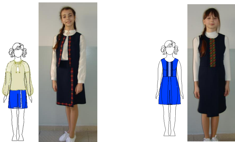
Figure 5: The models from collection “School uniform with elements of traditional Moldovan cloths”

School clothes will acquire a pronounced decorative effect when using embroidery elements, features of folk cut, ornament, ribbons, lace, which perform aesthetic functions and serve to decorate clothes [4]. Nearby are presented few models from collection “School uniform with elements of traditional Moldovan cloths” (fig.5).