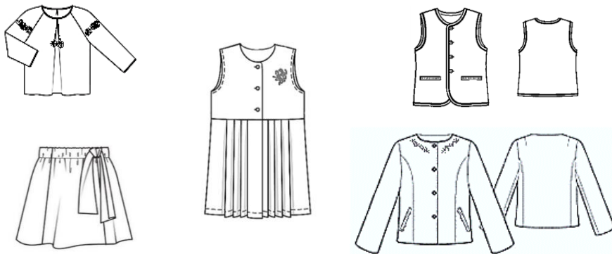
Figure 4: The range of assortment for school clothing

The package of materials for the developed set of school clothes should have high hygienic and hygroscopic characteristics and provide daily comfort, should consist of natural fibers [3]. The color scheme of a set of school clothes is simple: it is a combination of two or three colors. Aesthetic requirements for fabrics: the material must match the artistic and color design, purpose - texture and touch. Fabrics must have high wear resistance and hygiene, hygroscopicity and breathability, a high degree of color fastness to light, moisture, and dry cleaning.