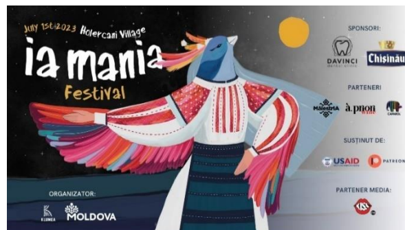
Figure1:.Ia mania Festival Poster [10]

Actually, in Moldova is evident this movement, the conjuncture is that people try to apply to their national identity, by using national clothes, organizing festivals which promote national traditions. All together create spirit of proudness to be Moldovan and a part of nation.