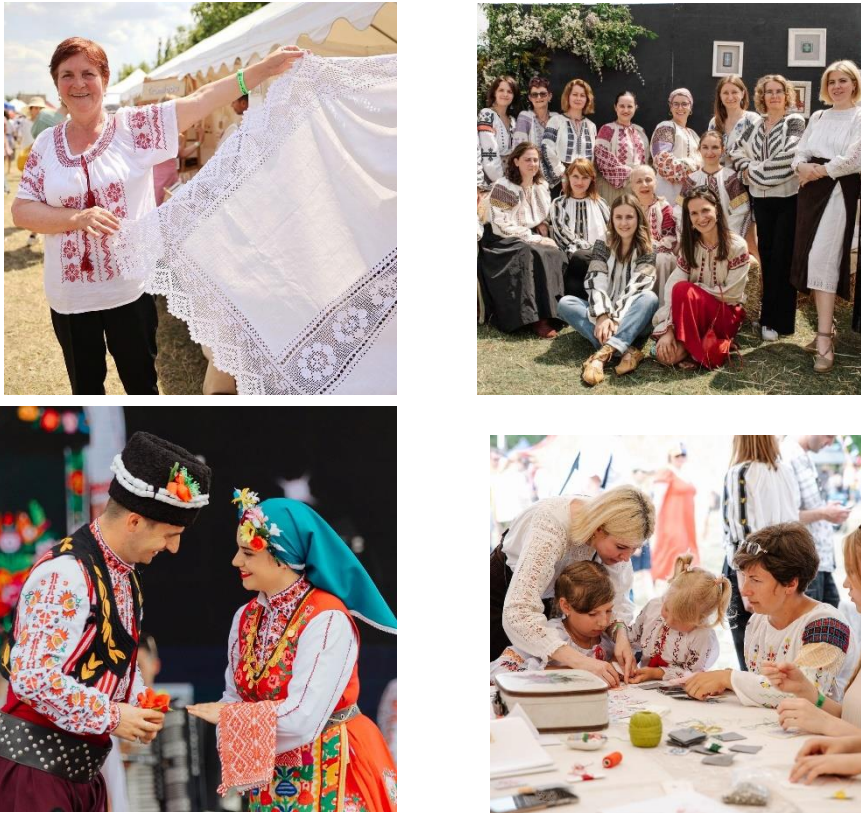
Figure 2: Promotion traditions on workshops from festival Ia mania [10]

The process of cultivating national identity starting from early age. A special role could be belonged to children's clothing, since it is in childhood that the foundations of personality development, self-identity are laid, and attitudes towards the world around are formed. In this study, we appeal to clothing for school, as it is a significant factor in the development, formation, upbringing and education of a child.