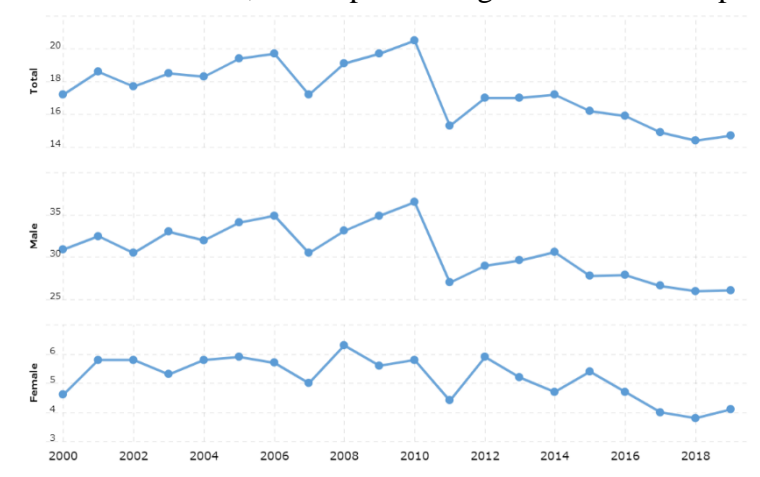
Figure 2. Rate of suicides in Republic of Moldova [3]

It is important to note that these estimates may be underestimated, as stigma and social taboo surrounding suicide can lead to underreporting. Addressing suicide at a global level requires a comprehensive approach that involves multiple sectors and stakeholders, including governments, healthcare providers, schools, communities, and individuals. This can include improving access to mental health services, reducing the stigma associated with mental illness, promoting healthy relationships and supportive environments, and implementing effective suicide prevention strategies.