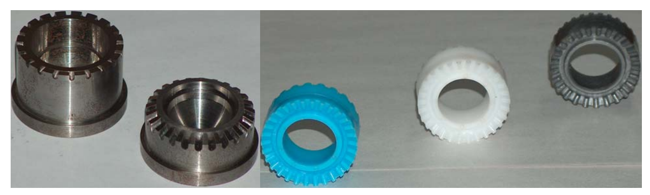
Figure 3. Set of moulds from the hollow mould.