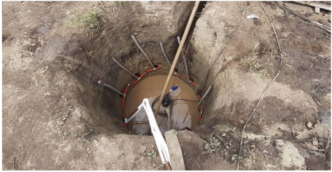
Figure 2 . Geothermal circuit of the heat pump in the village of Cania.

The main indicators of objects and heat pumps are presented in (table 1). Calculation of heat losses for this building was made for two boundary conditions of outdoor temperature -16 °C and 3 °C and at an indoor air temperature of 22 °C [13, 14]. The -16 °C/22 °C mode is selected to determine the heat pump capacity, the 3 °C/22 °C mode is selected to estimate the amount of heat required for the entire heating season to maintain the set indoor temperature.