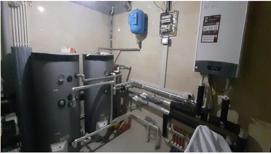
Figure 5. Gas boiler and hot water boilers.

In the heating mode, floor heating is used, and the heating working fluid is also supplied to the heating coils installed in the ventilation unit.