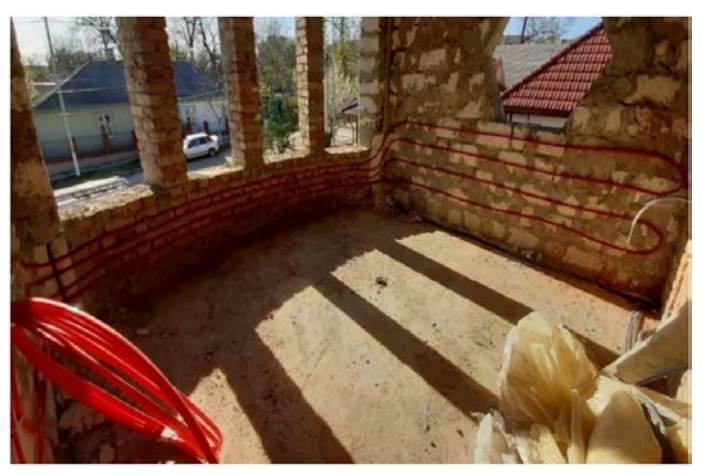
Figure 6. Location of pipes with coolant in the walls.

Heating and cooling of the building take place with the help of pipes embedded in the floor structure, as well as in the walls. In the building under consideration, the Multilevel<sup>tm</sup> technology proposed by the Swedish company Thermotech was applied. This technology is described in [17]. In this building, the floor heating on the first floor is made according to standard technology, with insulation under the pipe, to avoid heat loss to the ground, on the second floor, the floor heating piping is located directly on the floor slab. The thermal calculation of the heating system was performed using the Valtec calculation program. The power of the warm floor was insufficient, therefore, pipes with a heat carrier were additionally installed in the wall panels placed under the windows of the first floor (figure 6).