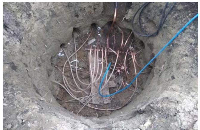
Figure 4. Geothermal circuit of the heat pump in the city of Comrat.

The estimated heat losses of the building in the -16°C/22°C mode are 15.1 kW, and in the average temperature mode for the heating season 2020-2021 3°C/22°C, they are 7.6 kW. For heating and cooling a house with an area of about 600 m<sup>2</sup>, a heat pump with a rated capacity of 18 kW is used, taking into account the expansion of the area. This heat pump was manufactured and installed by SRL "Climatehnic" in April 2020. The heat pump is also built based on direct evaporation technology, compressor control is the inverter, and the total length of geothermal probes is 320 m (figure 4).