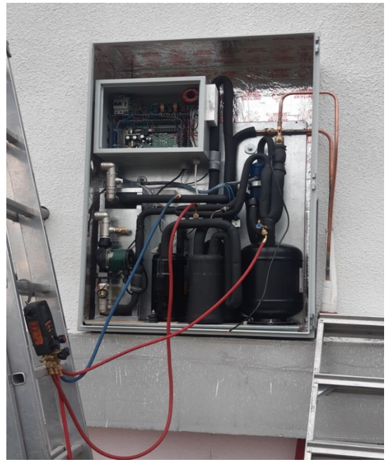
Figure 3. A heat pump implemented in the village of Cania.

This heat pump has a compressor, Copeland, Emerson Climate, the main parameters of the refrigeration circuit (boiling point of Freon