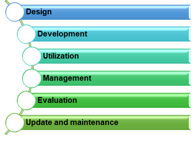
Figure 1. Core Domains of EdTech Field

Thus, the innovative aspects of specific didactics originate at the intersection of EdTech with various school and/or academic study objects.