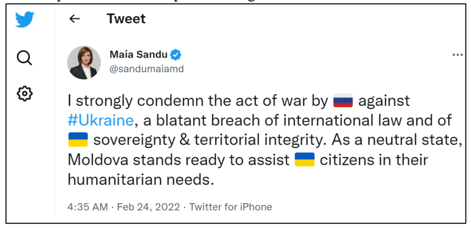
Figure 2. Maia Sandu's Tweet at the onset of the Ukrainian invasion [11]

External . An example of Maia Sandu's external action begins with the onset of the Russian invasion, when she quickly tweeted a statement shown in Figure 2. In two sentences, she clearly communicated the country's position, why she condemns such action, and then commits her country's neutrality and support. From that period forward she began working with various foreign decision-makers who would help Moldova accomplish those goals.