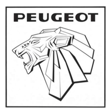
Figure 3. An example of the lion stylization in the Peugeot logo: on the left – biomorphic (1960); on the right - crystallomorphic (1965)