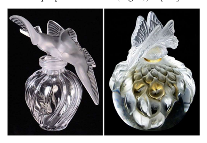
Figure 1. Rene Lalique perfume bottles

always solves the problem of harmonization and aestheticization. The main task of the engineer and designer is to convey to the consumer the meaning of the product, expressed in form, design and a clearly understood control system. Sometimes the designer sacrifices technology to create unique samples (for example, Rene Lalique perfume bottles (Fig. 1)). " [5-6].