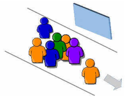
Figure 1. Traditional billboard

In this article we will analyze the operation of a billboard with digital display (LED screen, plasma screen, projector, etc.) on which are displayed advertising information that is perceived by pedestrians passing in front of the billboard (Fig. 1).