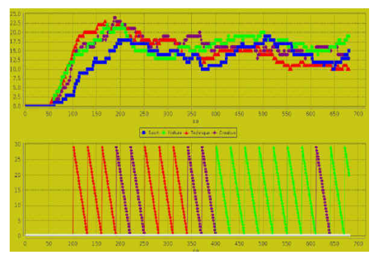
Figure 4. The evolution of groups and screen status over time

In Fig. 4 are shown the evolution of the groups and the state of the screen: at the top is the number of pedestrians in the 4 groups (4 different colors), and at the bottom are presented the timers for each time slot, their color indicates the category advertising displayed on the screen in that time slot.