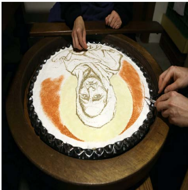
Figure 1: Painted coliva (in Bulgaria)

For Bulgarians, the coliva, in addition to the classic ingredients, in some variants, also includes parsley (Table 1). It is remarkable that after being placed on plates or plates the coliva is decorated with the faces of the saints. The images of the saints are produced in a particularly impressive and remarkable way. With a fine brush, determine the outline of the icon on the coliva sprinkled with sugar. In some monasteries they use a matrix, which defines the boundaries of the icon (a system created in the post-Byzantine era). After marking the edges of the icon, the clothing and other pieces in the image are painted in different colors. Candied almonds are added (Chervenkov et al., 2013), ("How the monks of St. Forest make a coliva (Как монасите от Св. Гореправятколиво)," 2018) (Figure 1).