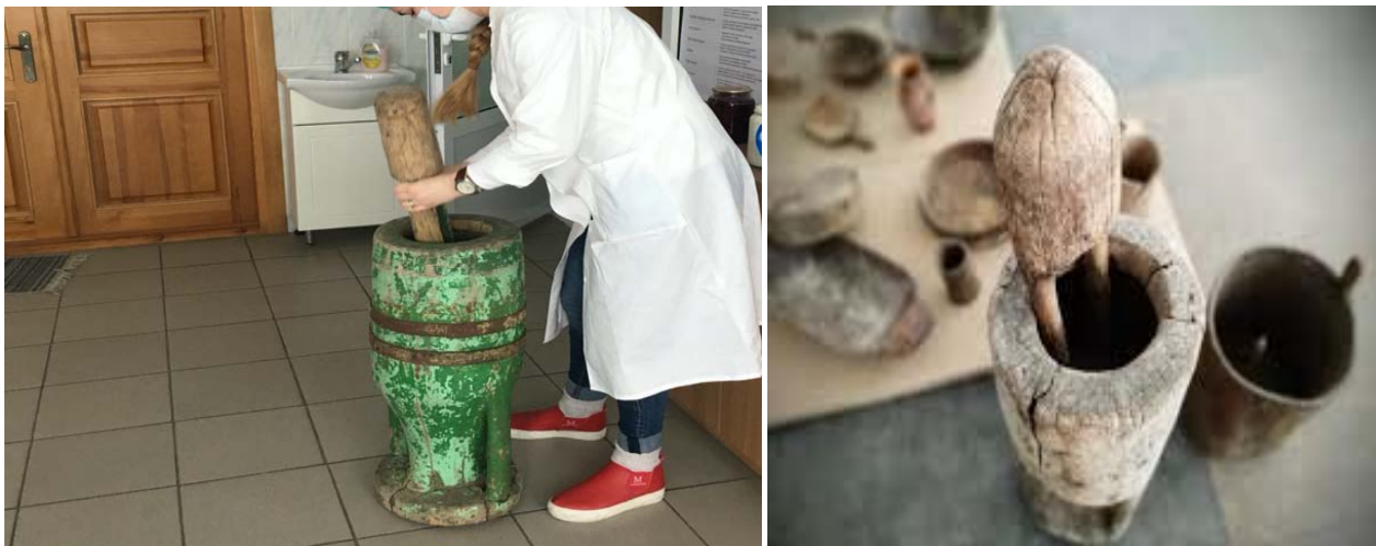
Figure 2: Examples of an old wooden „piuă” used to "beat" grain

to remove the higher states and slightly change the texture of the grain.