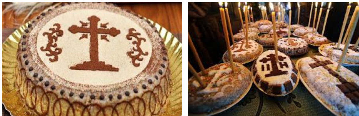
Figure 4: Colive for holiday (Coliva: definiție și minunea Sfântului Teodor Tiron – fotoreportaj de la decorarea colivei, n.d.)