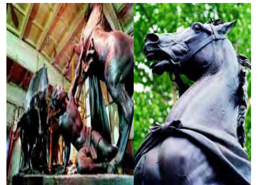
Fig. 11. Sculpture from group "Horse tamers" before and after restoration. Sankt-Peterburg.

Figures 10 and 11 present the sculptures " Angel on the column of Alexander" and "Horse tamers" before and after restoration.