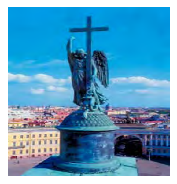
Fig. 2. Bronze angel from the top of the Alexander's column covered with greenish stain, Sankt-Peterburg.

On the objects cast in bronze, in time, an oxide film builds up, which in some cases is preserved on the archaeological objects as well [1].