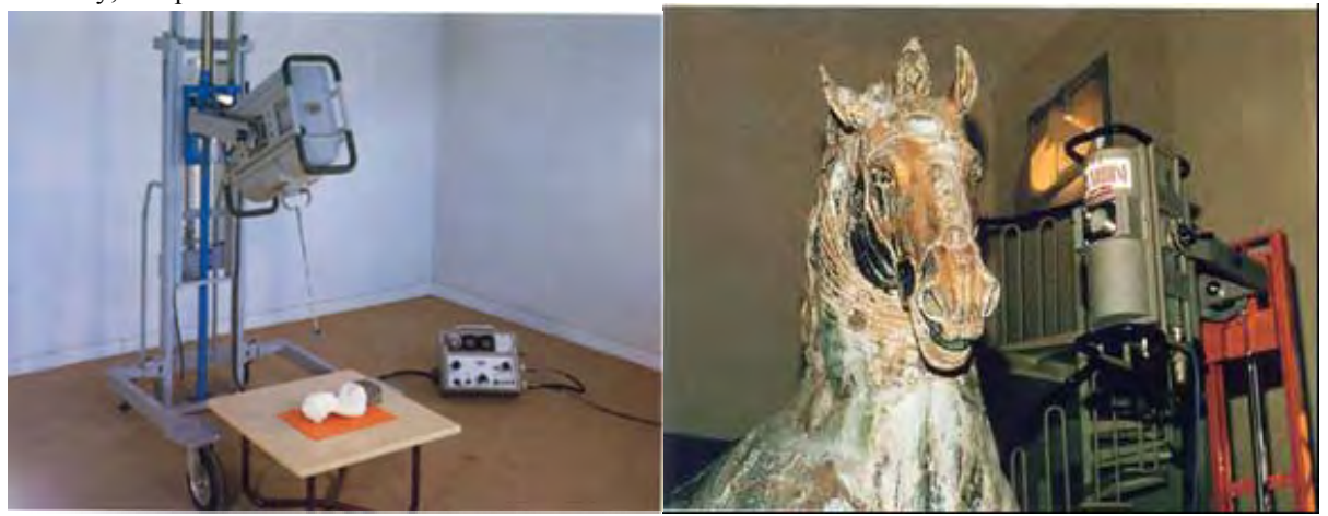
Fig. 6 Portable monoblock type MONOGIL MT 350/6 of roentgen ray for research of art objects made of metal, ceramic and stone. Sankt-Peterburg

The acetic acid thus formed in the reaction reacts again with the metal and thus it may result in the complete destruction of the object [5]. To study the defects occurring on the surface of the art objects use was made of various devices such as the single device MONOGIL MT 350/6 with roentgen-ray and high-power directed beam, intended for carrying out radiographic research on large thickness, metal, ceramic and stone statues and objects (fig. 6).