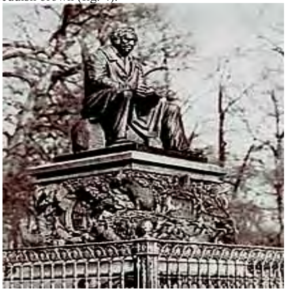
Fig. 4. Monument of Russian fabulist I.A. of Králové from the summer park opened in 1855. Sculptor P.K. Klodt

duration of interaction with the atmosphere and its composition, but also on the composition of the metal, the quality of processing, namely internal and external factors. All atmospheric stains contain oxides and salts. The copper oxide - black color, the protoxide – reddish brown (fig. 4).