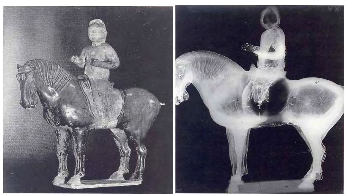
Fig. 7. Rider radiography, China, Tsin dynasty (618-906).