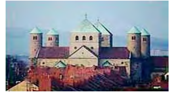
Fig. 5. Hildeshaime cathedral (Lower Saxony, Germany), which does not need roof replacement for 700 years.

A special case of destruction of the copper alloy is the corrosion relapse also called the bronze disease, which may appear on the archaeological objects made from copper and its alloys well as on objects in the museum regardless if they have been cleaned or not. The first signs of disease are characteristic spots occurring on the surface of the object, of light green color and loose structure.