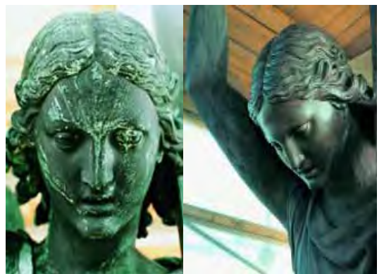
Fig.10. Angel face on Alexander column before and after restoration. Sankt-Peterburg