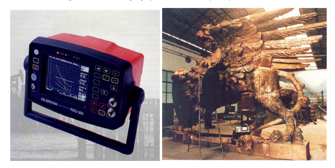
Fig. 8. The defectoscop type RDG 500 to control the layer state of preservation, thickness measurement, detection of hidden defects in metal, ceramic and marble sculptures.

Figure 7 presents the x-ray of a sculptures of the Tsin dynasty, which confirms the integrity of the material: it can be noted the oxide layers and the good piece-casting quality, low density of the material of feet and some parts of the horse saddle.