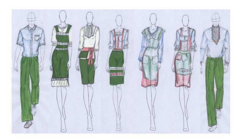
Figure 2: Network design uniforms for employees of stores "Linella"