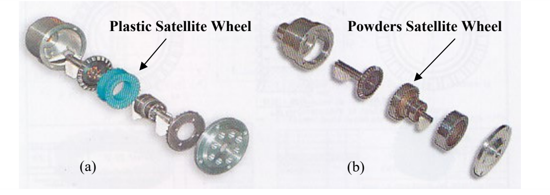
Figure 2. Planetary precessional kinematical gear box: (a) Satellite wheel made of plastic material type Hostaform C2091 (b) Satellite wheel made of powders material type \mathcal{K}rp7 .

In practice we can use various methods to minimize vibration and noise levels in dynamic systems. Mechanical transmissions used in various machines and installations are sources of high frequency vibration and noise. The most effective, but also the most expensive way to get quieter transmission, is the method of execution of machine parts with very high precision or method of static and dynamic balancing of moving parts. For kinematical PPT we recommend correct choice of materials for gearwheels in terms of shock and vibration damping. One of the main advantages of PPT is the multiplicity meshing (up to 100% pairs of gearing teeth). For kinematical PPT satellite block can be made of plastic materials with damping properties (absorption) of gear shock. For this purpose has been developed kinematic precessional reducer (figure 2), with satellite block made of plastic materials type Hostaform C9021, and satellite wheel made of powders material type Krp7 [3, 4], see figure 2.