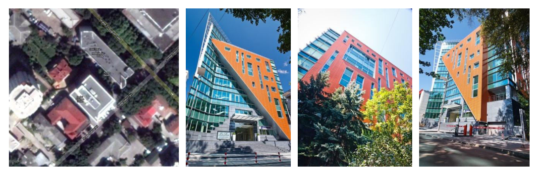
Fig. 4. Business center "Le Roi" (situational scheme, images of building)

The composition of the business center is a combination of vertical dominant rectangular prisms with large triangular elements which are decorating two facades of the building. Composition of the building has a distinctly dynamic character through the using of triangular forms which are in the typical position. The base of the architectural composition is revealed by the use of visually solid finishing material and a small number of divisions of the facades (Fig. 4.).