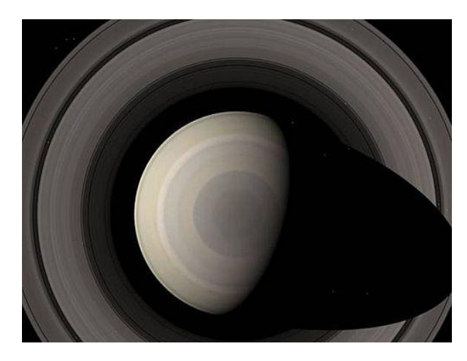
Figure 1. Photo taken by the Voyager Space Probe of the vortex motion of gaseous medium at the poles of the planet Saturn [1]

The astronomers discovered an interesting peculiarity of the phenomenon —the central part of the vortex was of hexagonal shape. It could be seen on the photographs, made by Voyager space balloon that hexagonal shape was not very much clear. (See cyclone's "eye").