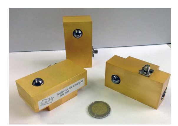
Figure 1: A photograph with commercially-available standard Schottky diode detector modules incorporating the detector and different amplifiers.

Figure 2. The spectrum was obtained with the Fourier transform spectroscopy (FTS) and normalized to the spectral sensitivity of a Golay Cell detector which was measured with the same FTS instrument.