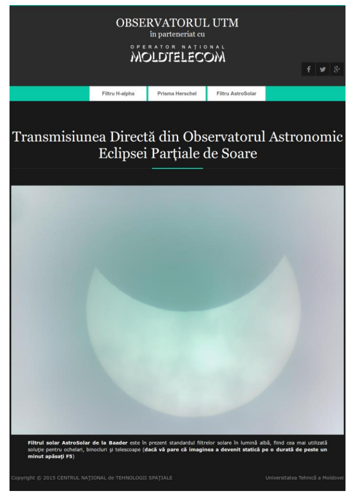
Fig. 2. View of the live.utm.md on the 20<sup>th</sup> of March 2015. This website was created for streaming captured images from 3 telescopes prepared for observing solar eclipse.

MJPG-streamer, as well as the main web server, is installed on the server. This has the advantage that in case of Denial-of-Service attack on the server, PC which is controlling the camera won't be affected in any way and will continue its work. Also, in case of traffic congestion visitors are still able to watch the stream, but with a reduced rate of frames per second. For redundancy and fallback purposes the pictures from PC can be easily sent to several web servers at the same time, allowing to stream on several web sites (which can be even hosted by different providers in different countries). Another solution for redundancy and failback is usage of the peer-to-peer technology (e.g. AceStream). It allows to reduce drastically bandwidth requirements and connection of unlimited number of viewers (more viewers - more stable streaming). Last one solution for backup streaming is using one of the existing wellknown on-line services e.g. Ustream and YouTube. For highquality on Ustream is necessary to pay, on YouTube it is free but the video bitrate is not enough for preserving fine details. And there are also other problems - Ustream can stream only from traditional camera sources for free, for HTTP retransmission is necessary to install shareware Windows software; YouTube allow as input only traditional cameras and desktop sharing. Altogether, this services can be used, but without flexibility and easiness (especially if using free services).