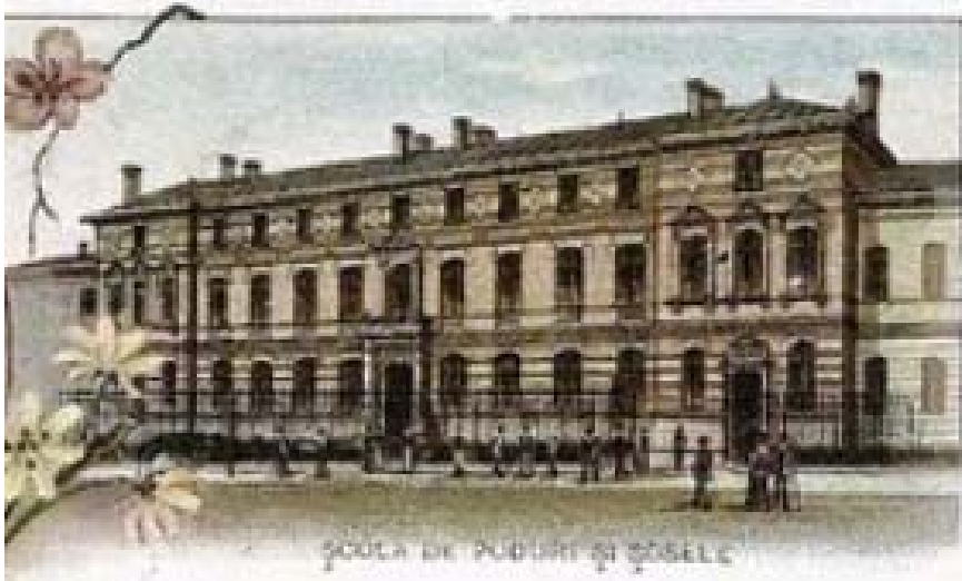
Fig. 3. October 1st, 1864, Prince Alexandru Ioan Cuza signed a decree establishing the "School of Bridges and Roads, Mines and Architecture" in Bucharest.

years of joint courses and a final year of training (specialization with two sections: Civil Engineering and Mining Engineering).