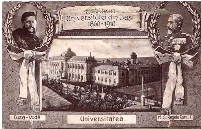
Fig. 2. Within the Faculty of Sciences, the Electrical School in 1910 was created.

Because of the events during the Second World War, the Institute moved to Cernăuți, then returned to Iași, via Turnu Severin. The socialist industrialization, the post-December 1989 atomization of the higher polytechnic education, made that the modern Technical